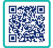
The Facts About FIA Rates

Market conditions and interest rates change, but Delaware Life Insurance Company's goal is to maintain a consistent options budget so that we can provide the highest possible renewal rates.